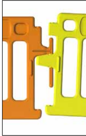
LIFT ONE BARRIER TO LOCK